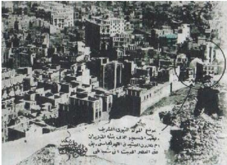
The place of birth of Prophet Mohammad (صلى الله عليه و آله وسلم) shown in circle

The following Ahadith confirm that it was festive celebration in the entire Cosmos when Prophet Mohammad (صلى الله عليه و آله وسلم) was born.