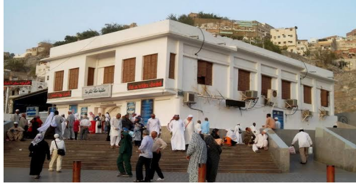
The place of birth of Prophet Mohammad (صلى الله عليه و آله وسلم)

References - Musnad Ahmad Vol. 4, Page 127; Ibn Hisham; Tafsir Ibn Kathir, Vol. 4, Page 360; Bayhaqi, Dala'il an-Nubuwwah, Vol. 1, Page 110; Haythami, Zawa'id, Vol. 8, Page 221; Ibn al-Jawzi 'al-Wafa'; Qadi Iyad, 'al-Shifa', etc.